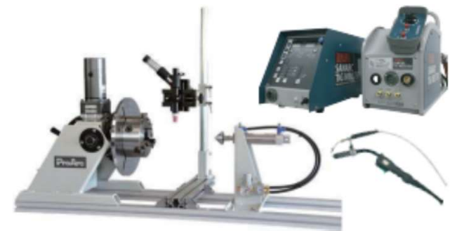
High-Efficiency Semi-Automatic TIG Welding System [Sanarc TIG Meister] Equipped Rotating Pipe Welding System Package