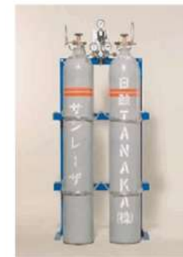
Stable Gas Supply System for CO 2 Laser Cutting Machines