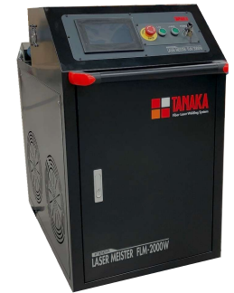
Fiber Laser Welding Machine with Three Functions: Welding, Cutting, and Cleaning [FLM-2000W]