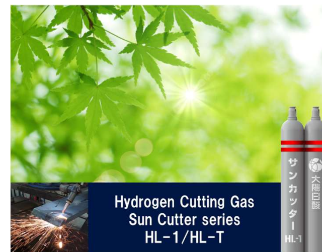
Hydrogen Cutting Gas Sun Cutter series HL-1/HL-T