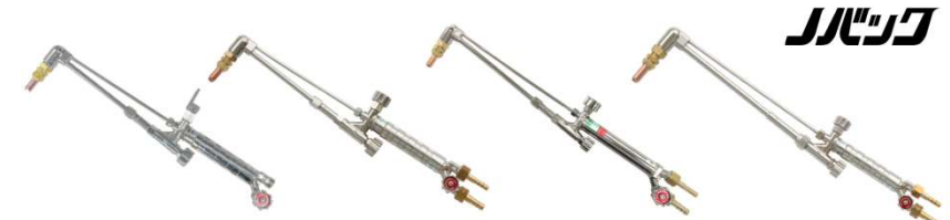
Medium Cutting Torch Z Trigger