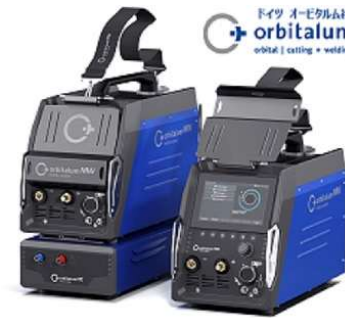
Orbitalum Automatic Pipe Welding Machines for High-Purity Pipe Welding in Semiconductor and Other Fields

To meet customers' labor-saving needs, we offer system packages that integrate peripheral equipment, leveraging our technological expertise in cutting and welding. We strongly support their automation efforts with a variety of solutions, including collaborative robots.