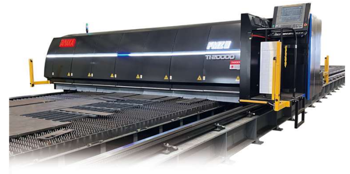
The Next-generation Gantry Bevel fiber laser cutting machine [FMZ III]

With sales offices in China and the U.S., we are expanding our sales activities in Korea, the U.S., and the Southeast Asian region, focusing on laser cutting machines.