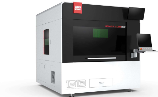
Compact Fiber Laser Processing Machine with Outstanding Cost Performance [SMART CUBE]