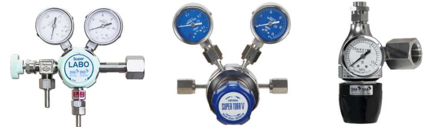
S/LABO S Products with Antibacterial and Antiviral SIAA Mark Certification

Internationally, we are strengthening our sales infrastructure in Southeast Asia, supported by our factory in Thailand and a marketing base in Vietnam.